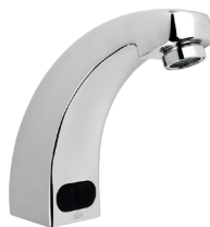
#81518 (Z6913) Single Hole #81076 (Z6913-CP4) w/4" Plate #80332 (Z6913-CP8) w/8" Plate