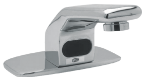
#59250 (Z6912) Single Hole #81077 (Z6912-CP4) w/4" Plate #81078 (Z6912-CP8) w/8" Plate