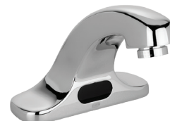
#80323 (Z6915) w/4" Plate